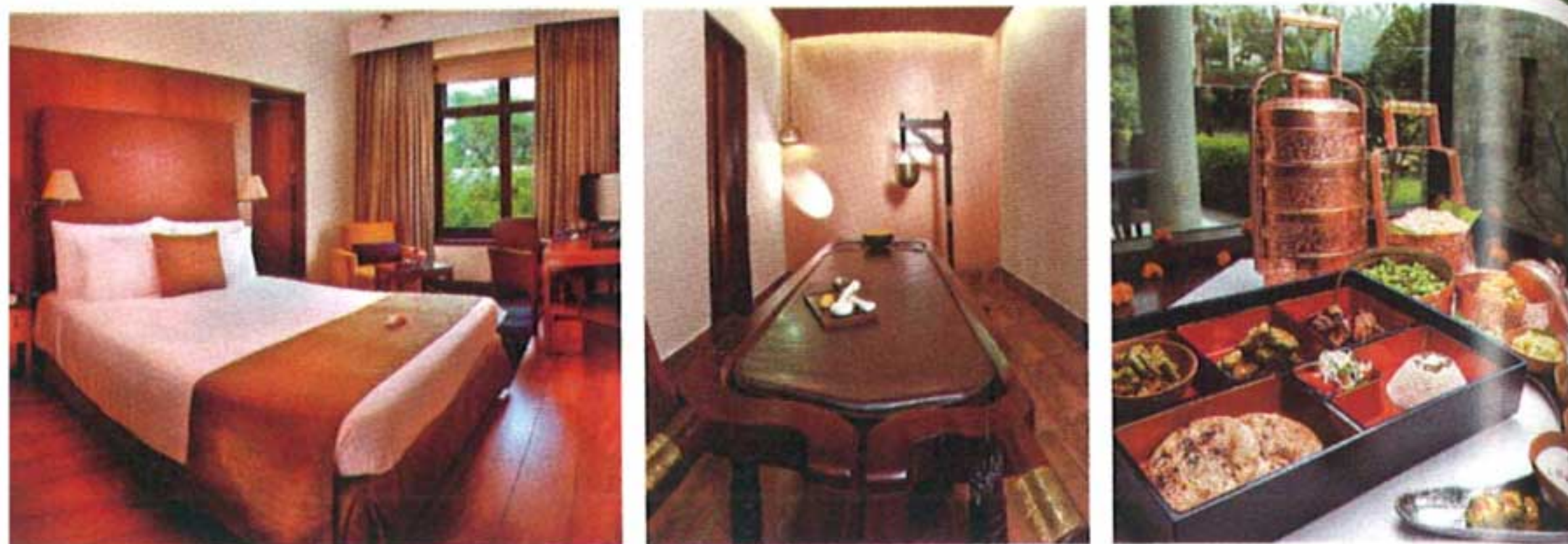
An escape within the city, the Manor hotel is an oasis of wellbeing